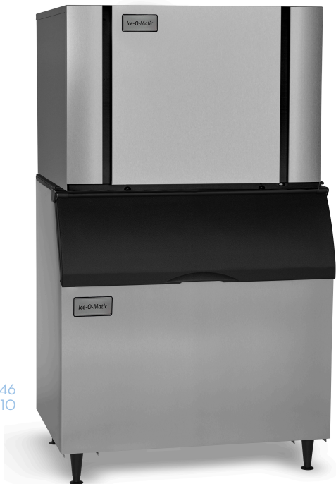
CIM1446 ON B110