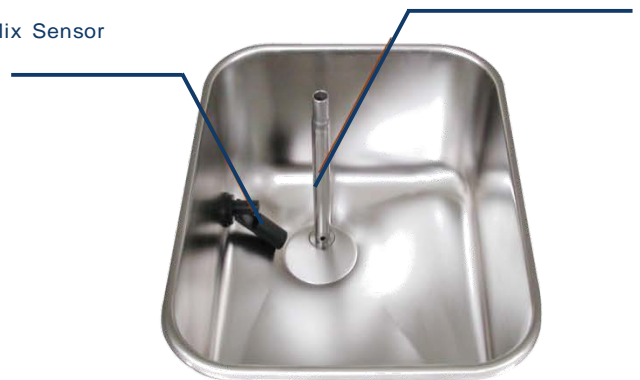
Low Mix Sensor