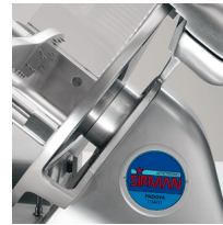
More space between blade and body machine