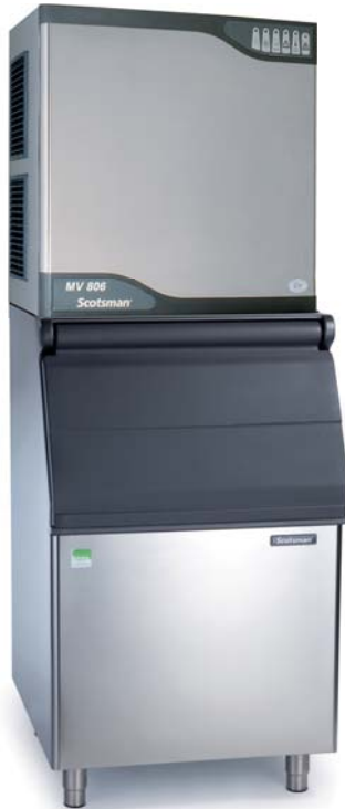
MV 806 with SB530 (sold separately)