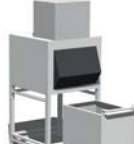
MV806+SIS700 (sold separately)

This product qualifies for the following listings: