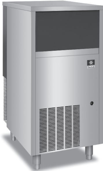
Model RF-0266A Flake Ice Machine