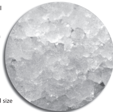
Ice shown actual size

Flake ice is small hard bits of ice ideally suited for presentation applications.