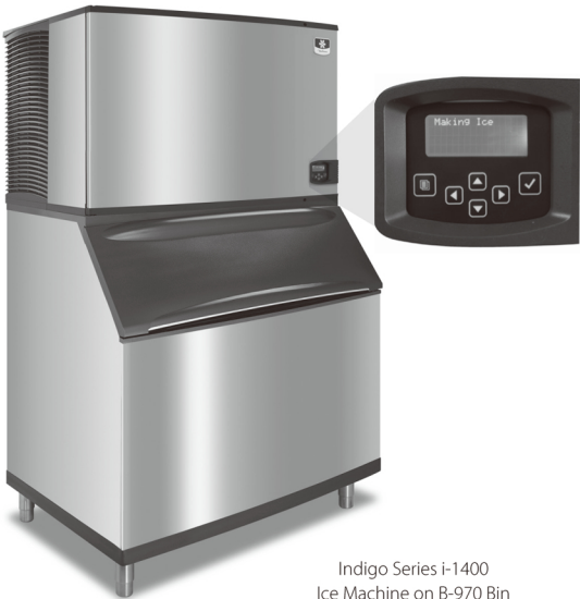
Indigo Series I-1400 Ice Machine on B-970 Bin

Designed for operators who know that ice is critical to their business, the Indigo™ Series ice machine's preventative diagnostics continually monitor itself for reliable ice production. Improvements in cleanability and programmability make your ice machine easy to own and less expensive to operate.