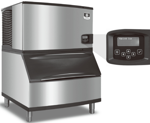
Indigo Series I-300 Ice Machine on B-170 Bin

Designed for operators who know that ice is critical to their business, the Indigo™ Series ice machine's preventative diagnostics continually monitor itself for reliable ice production. Improvements in cleanability and programmability make your ice machine easy to own and less expensive to operate.