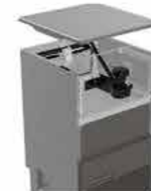
Detachable parts for easy cleaning