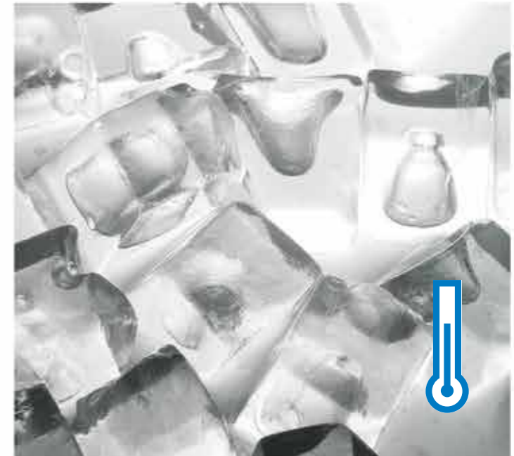
Slow Dilution Slower melting speed due to -7^{\circ}\text{C} of inside temp of ice cube