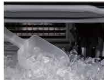
NSF certified material for Bin and Scoop