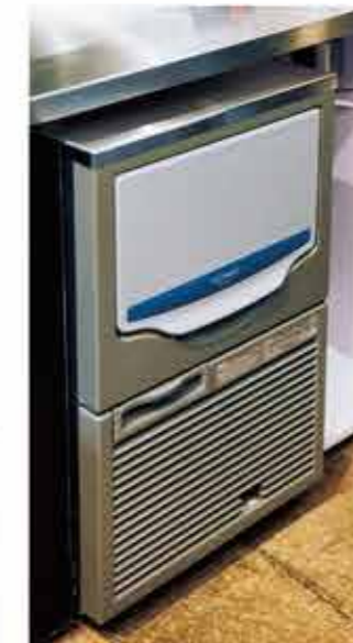
Compact design for under counter installation