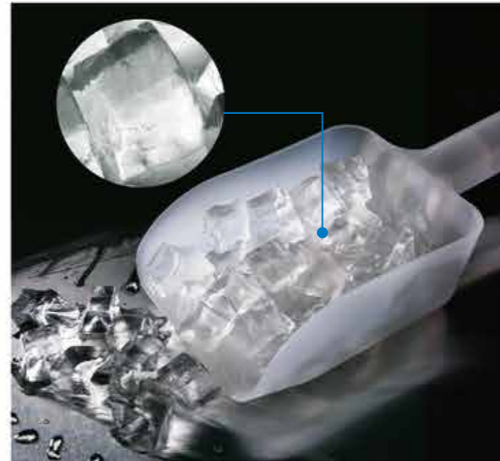
Dice Cube 22mm Pure and Clear Cube