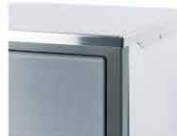
Stainless Steel (SUS304)