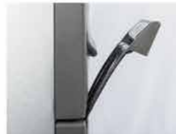
Air filter prevent dust from entering