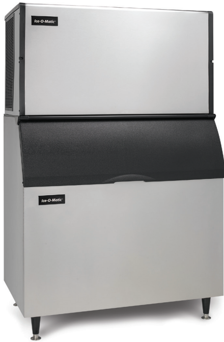
ICE1806 ON B100